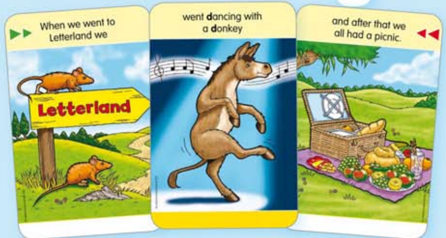
Pre-production b&w samples