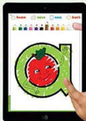
Fun and interactive activities help to engage your child