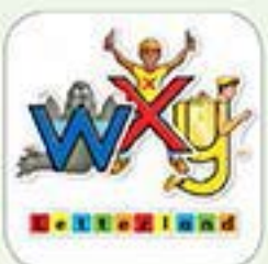
Letterland Stories WXY