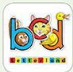
Letterland Stories BCD