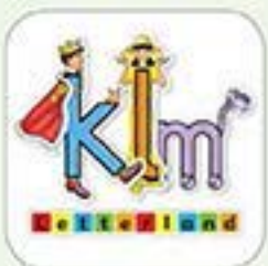
Letterland Stories KLM