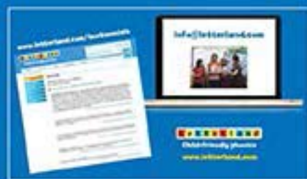
References for further information