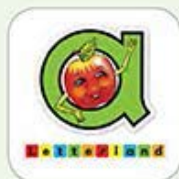
Letterland Stories A Annie Apple and the ants