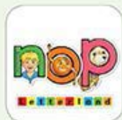
Letterland Stories NOP