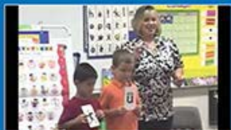
Real-life classroom examples