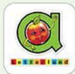
Letterland Stories A

Search 'Letterland Stories' on the App Store, Google Play Store, Windows Store or amazonappstore.