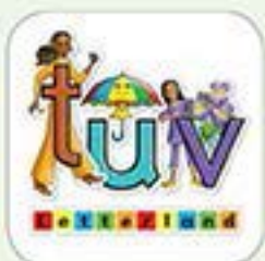
Letterland Stories TUV