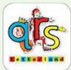
Letterland Stories QRS