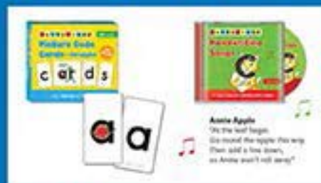
Helpful material suggestions