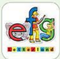
Letterland Stories EFG