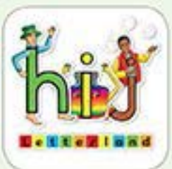
Letterland Stories HIJ