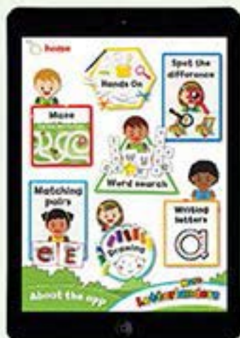
Choose from a range of games and activities