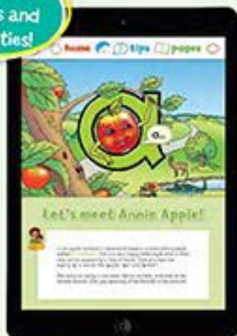
Read the stories with or without audio support