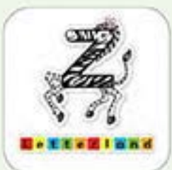
Letterland Stories Z

Letterland apps are available from the Apple App Store (iOS) or the Google Play Store (Android) and will work on most tablets. If you are a school and would like to purchase Letterland apps in volume, we recommend the Apple Volume Purchase Program.