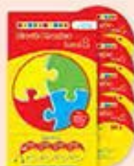
4 Audio CDs