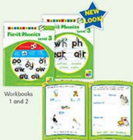
Workbooks 1 and 2