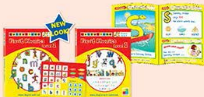
Student Book 1 + Stickers