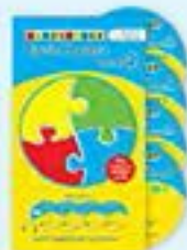
4 Audio CDs