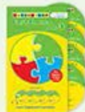
4 Audio CDs