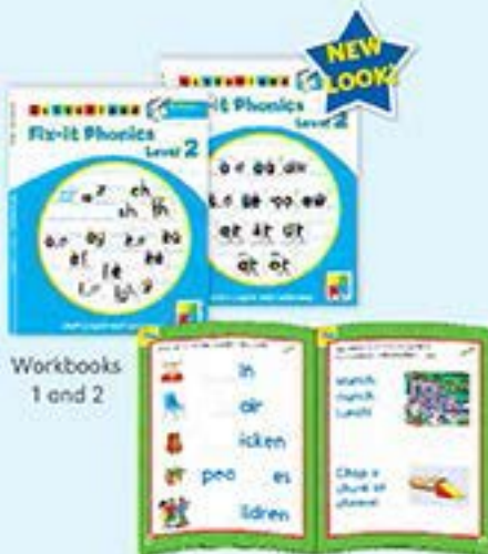
Workbooks 1 and 2

Individual items can be purchased separately. See www.letterland.com for information and ordering details.