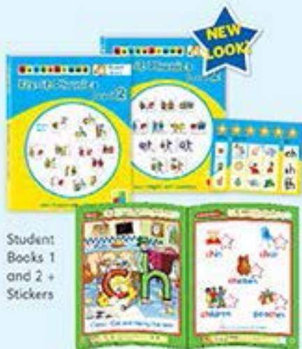
Student Books 1 and 2 + Stickers