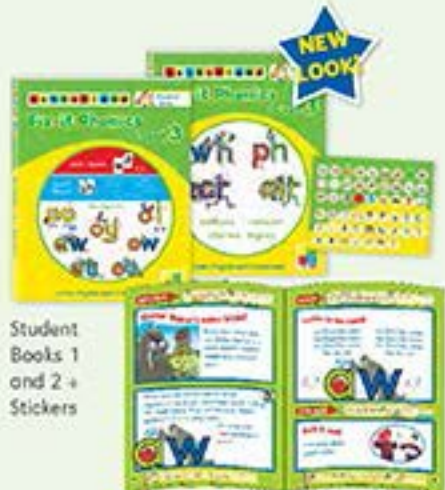
Student Books 1 and 2 + Stickers